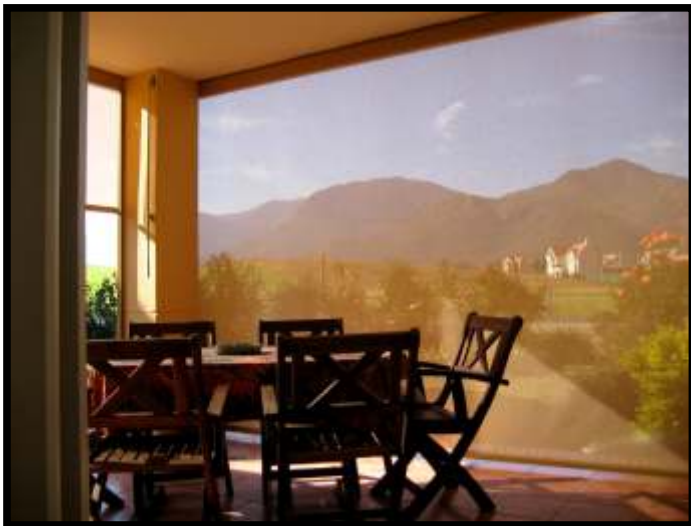
Fabric : Soltis 86®

A house on a golf estate with a sunny veranda and lovely views across the estate towards the mountains.