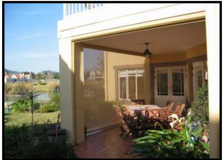
Blind maker : AC Screens