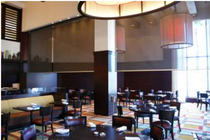
Fabric : Soltis 86®

Case Study Large restaurant that needed to screen off an area that was not continuously in use.