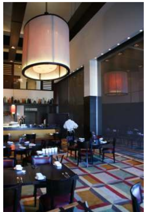
Blind maker : Super Tracks