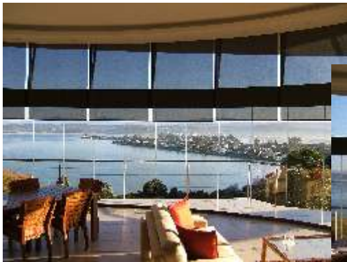
Fabric : Soltis 86®

This large family home is situated high above Knysna with spectacular views over the river estuary. The architect wanted to provide adequate protection from the sun without obscuring the view.