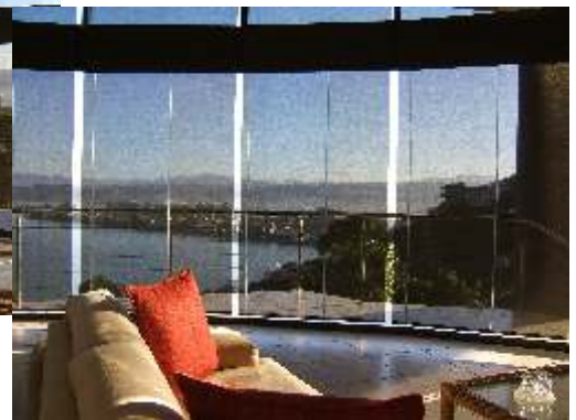
Blind maker : AC Screens