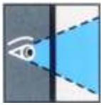
Visibility toward the outside