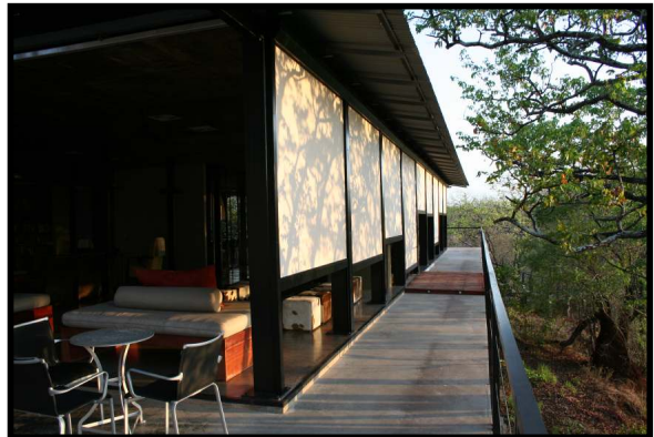
Fabric : Soltis 86®